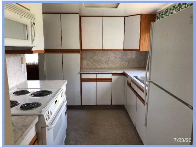
Brick front entry way (left). Kitchen on the right including electric range, refrigerator, and microwave. Dining room (below left) and the master bedroom with rose-imprinted carpeting.